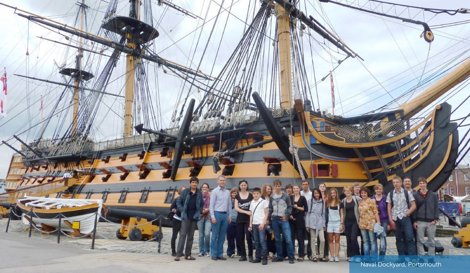
Naval Dockyard, Portsmouth