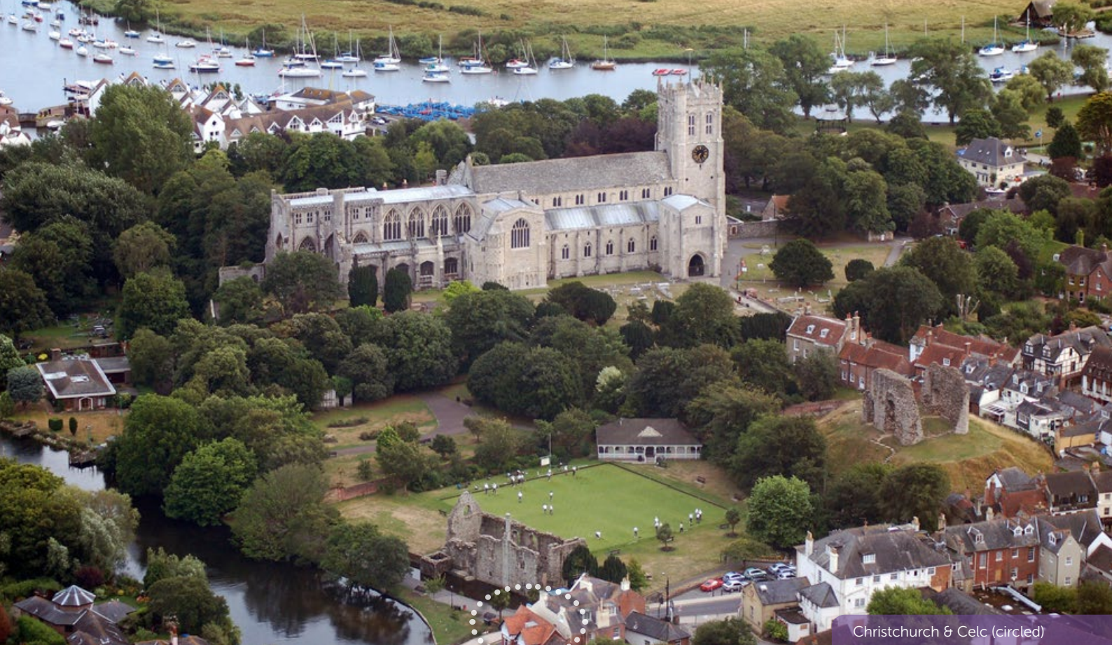
Christchurch & Celc (circled)