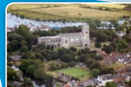
Christchurch is located on the south coast of England