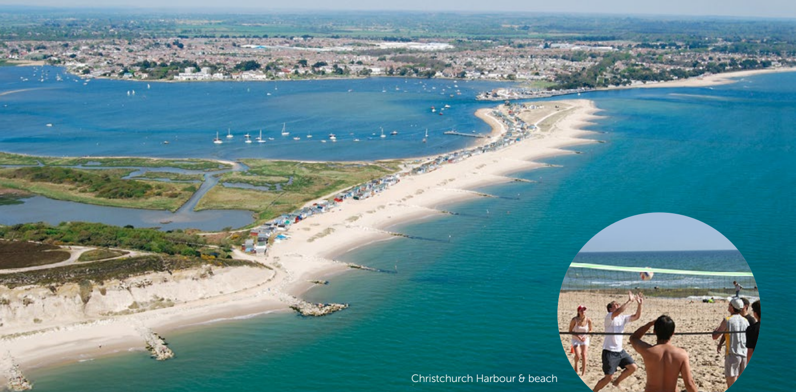
Christchurch Harbour & beach